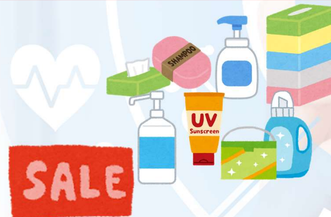
Selling daily necessities