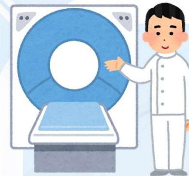
Radiology or imaging