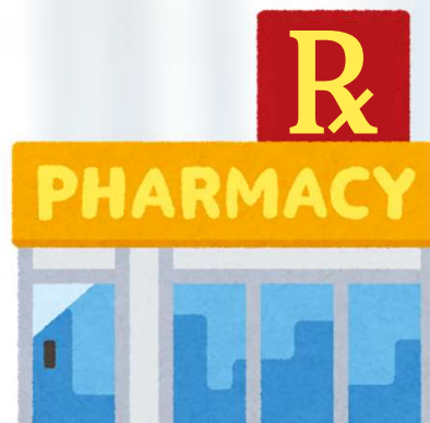
Pharmacy or dispensing