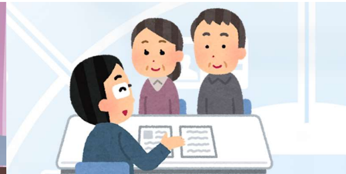
Sales promotion of medical insurance

Separate entrance NOT shared with a licensed/exempted premises