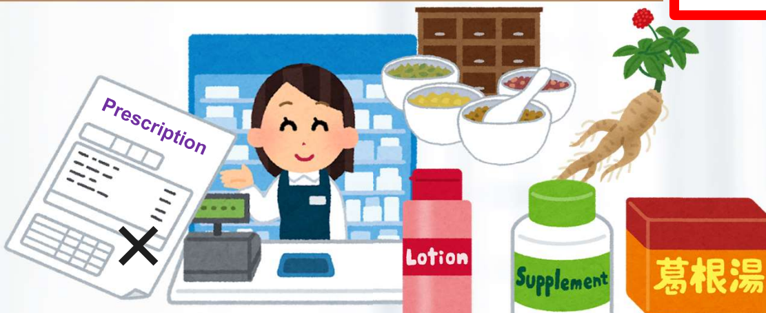
Selling health supplements, skin care products, proprietary Chinese medicines and herbs without prescription

Separate entrance NOT shared with a licensed/exempted premises