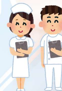
Other allied health professionals