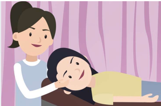
Beauty services (e.g. haircut, manicure)