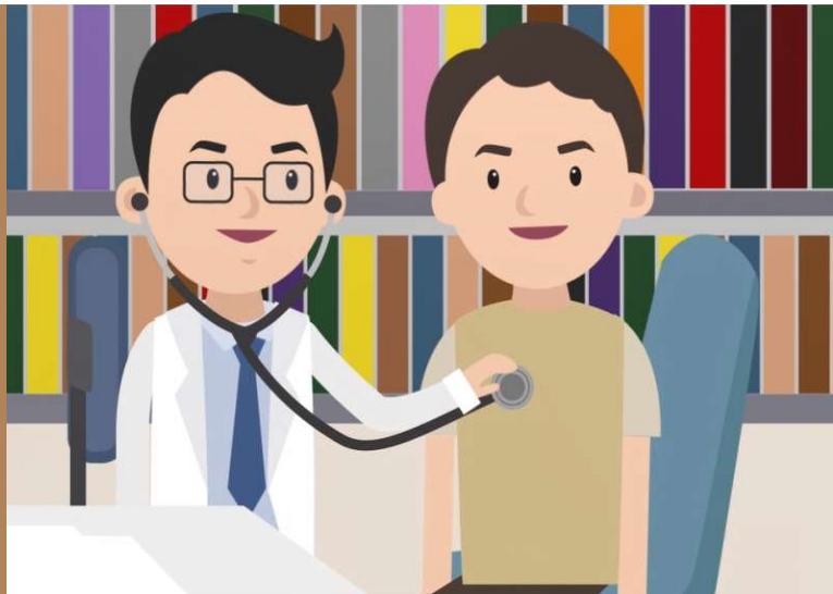
Licensed / exempted premises